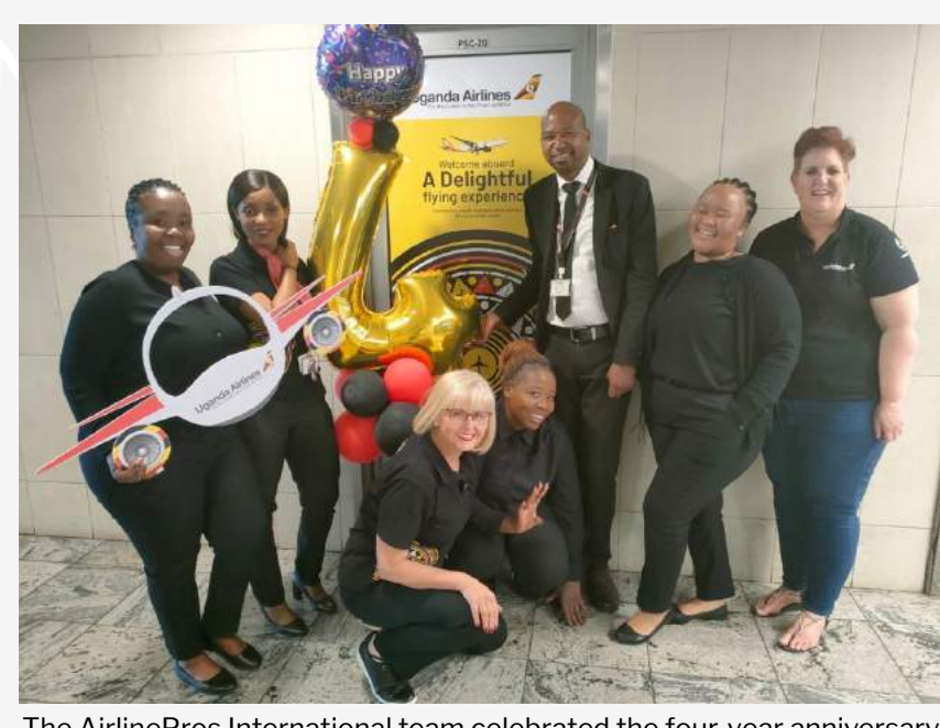
The AirlinePros International team celebrated the four-year anniversary of Uganda Airlines' first flight at the end of August.

Uganda Airlines connects travellers to some of Africa's most incredible tourist routes and experiences, from wildlife safaris to gorilla trekking and adventures at the source of the great Nile River. Uganda Airlines operates non-stop flights from Johannesburg to Entebbe and will add a new service to Mumbai and Lagos in Q4 of 2023. Other destinations on the airline's network include Juba, Mombasa, Nairobi, Zanzibar, Kilimanjaro, Dar es Salaam, Mogadishu, and Dubai. The airline takes the customer experience seriously, with ancillary services ranging from lounge access to preferred seating. Uganda Airlines is on a quest to become the airline of choice for business and leisure travellers by expanding its network into other parts of southern Africa, Europe, the Middle East, and the Far East.