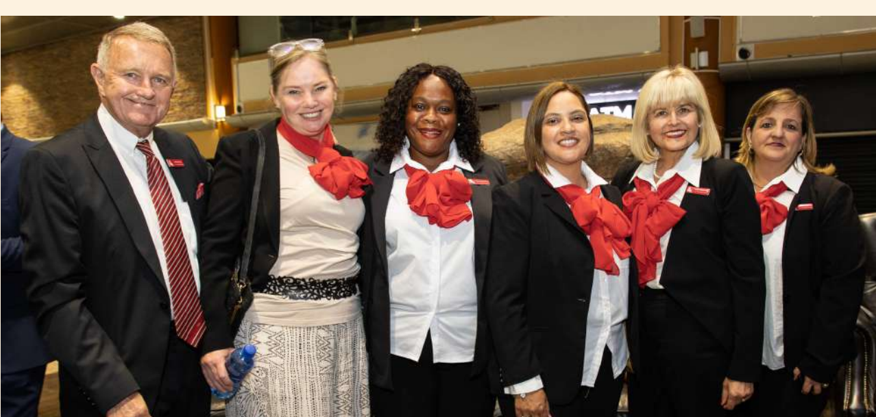
Pictured above: Team AirlinePros South Africa will represent LAM Mozambique Airlines at various trade events and travel shows this year, while offering sales and booking support backed by AirlinePros International's global professional network.