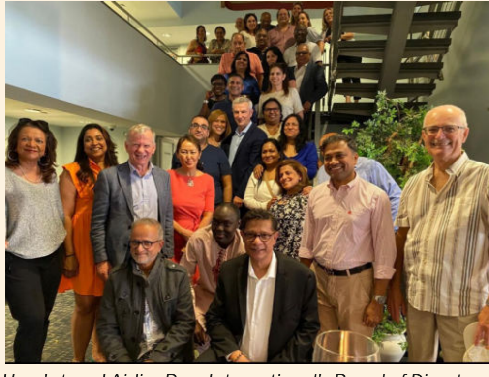
Here's to us! AirlinePros International's Board of Directors pictured (above) at the Intrepid Sea, Air & Space Museum in New York.

Blending strategic planning and team bonding, the recent AirlinePros International Board of Directors' meeting was followed by a get-together at the Intrepid Sea, Air & Space Museum in New York.